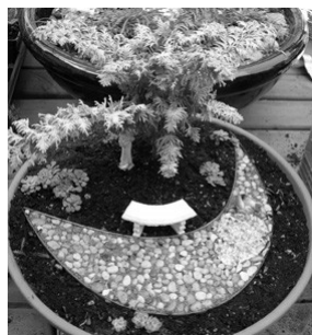
A Tray Garden

This competition will be judged at the summer fete, all you have to do is take a tray and either plant a garden using