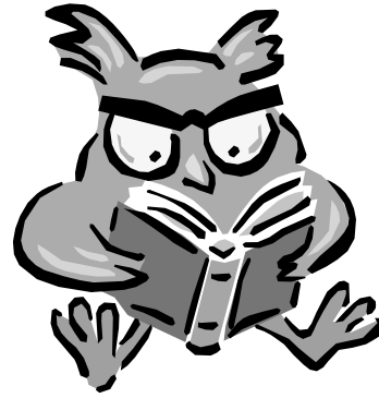
What do we do?

Not only do we support with the big things we also provide little things including guillotines, laminators and buying copyrights for school plays.